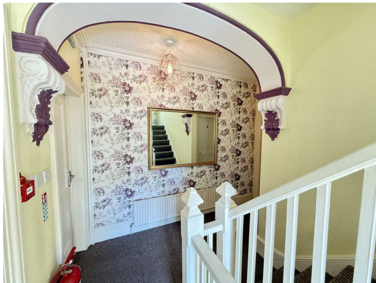
Feature ceiling arch, radiator